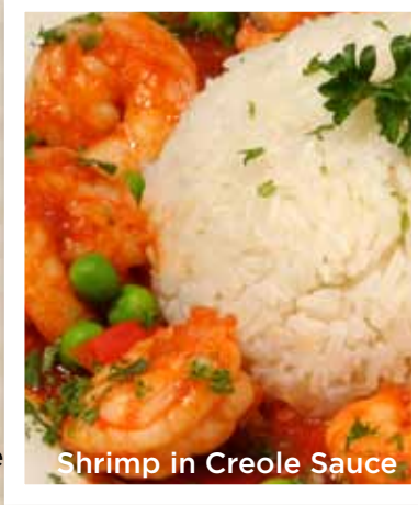
Shrimp in Creole Sauce