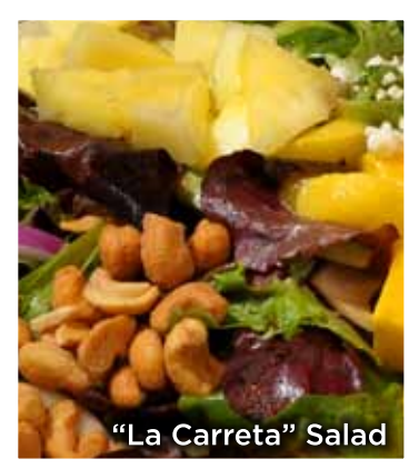
“La Carreta” Salad

Stuffed Avocado Seasonal ..... 9.95 Half of an Avocado Stuffed with Your Choice of Tuna or Chicken Salad.