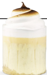
Lemon curd meringue cheesecake / GF / 9.5

Dense and rich chocolatey cake with organic cacao and goji berries