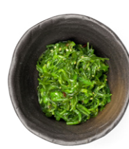
Seaweed salad VG / 4.5