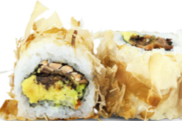
Crunchy salmon roll (6pcs.) / 6.5 / GFO Crunchy grilled salmon skin and avocado rolled in dried fish flakes