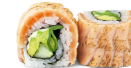
Aburi salmon roll (6pcs.) / 13.5 Avocado, snow peas and cucumber with miso aioli sauce roll topped with seared salmon, unagi sauce, sesame seeds and salmon roe