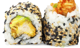
Crispy shrimp roll (6pcs.) / 9.5 Breaded shrimp and avocado with spicy and unagi sauces rolled in sesame seeds