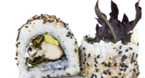
Crunchy chicken roll (5pcs.) 6.5

Tempura soft shell crab, cucumber and avocado with spicy sauce topped with capelin roe, sesame seeds and unagi sauce