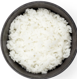
White rice GF / VG / 3