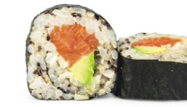
Salmon quinoa roll (5pcs.) / 7.5 Brown rice roll with quinoa, salmon and avocado