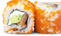
Alaska roll (6pcs.) GFO / 9.5 Salmon and avocado with cream cheese rolled in capelin roe