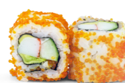
California roll (6pcs.) / 8.5 Crab stick, avocado and cucumber with mayonnaise rolled in flying fish roe