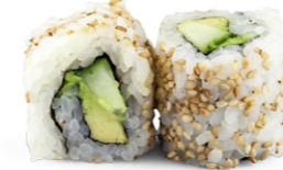
Avocado & cucumber roll (6pcs.) / VG / GFO / 5.5 Avocado and cucumber rolled in sesame seeds