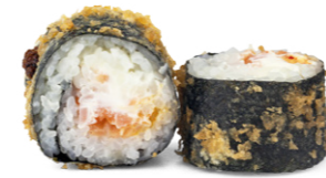
Crispy spicy salmon roll (5pcs.) 11.5

Grilled chicken tenderloin, lettuce, cream cheese, avocado, sesame seeds and tempura flakes with spicy and unagi sauces