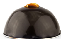
Caramel chocolate dome GF / 9.5

Smooth and creamy cheesecake with refreshing lemon curd and meringue frosting