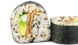
Veggie quinoa roll (5pcs.) / VG / 5.5 Brown rice roll with quinoa, cucumber, avocado and inari