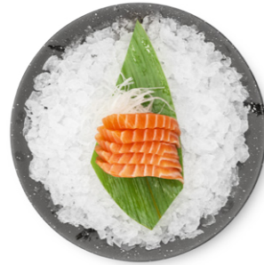
Salmon sashimi / GF / 8.5