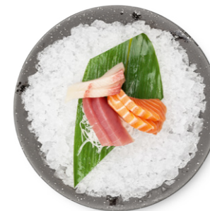
Mixed sashimi GF / 13.5 Assortment of salmon, tuna and kingfish sashimi