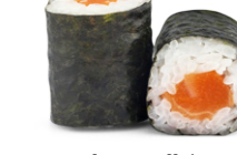
Salmon roll (6pcs.) GFO / 5.5