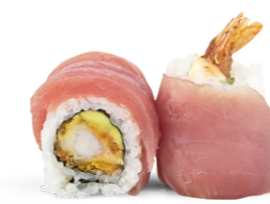
Shrimp roll with tuna (6pcs.) / 17.5 Breaded shrimp and avocado with spicy sauce roll topped with tuna and flying fish roe