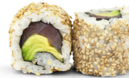
Tuna & avocado roll (6pcs.) / GFO / 12.5 Tuna and avocado rolled in sesame seeds