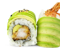
Shrimp roll with avocado (6pcs.) / 11.5 Breaded shrimp with spicy sauce roll topped with avocado, unagi sauce and sesame seeds