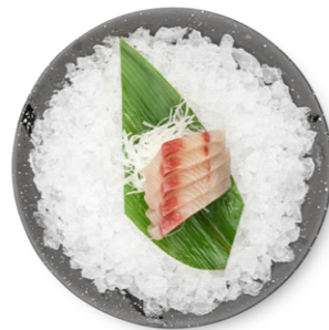
Kingfish sashimi / GF / 9