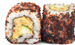
Spicy tuna roll (6pcs.) / 11.5 Tuna and cucumber with spicy sauce rolled in sesame seeds and red pepper