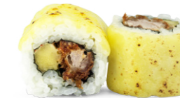
Aburi cheese roll (6pcs.) / 10.5 Breaded chicken thighs and mango with spicy sauce roll topped with seared cheese