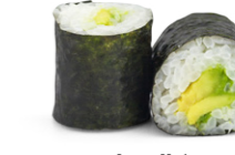
Avocado roll (6pcs.) VG / GFO / 4