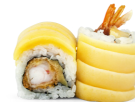
Shrimp roll with mango (6pcs.) / 10.5 Breaded shrimp with miso aioli sauce roll topped with mango