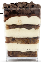
Tiramisu GF / 9.5

Delicious caramel chocolate mousse with soft caramel centre on almond cacao crunchie