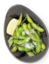
Edamame beans GF / VG / 4.5 With Sea salt and lemon, warm or chilled