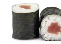
Tuna roll (6pcs.) GFO / 7.5