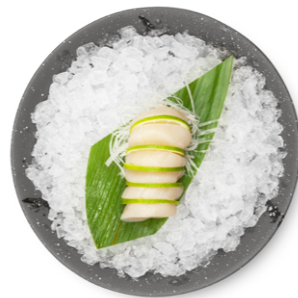
Scallop sashimi / GF / 11.5