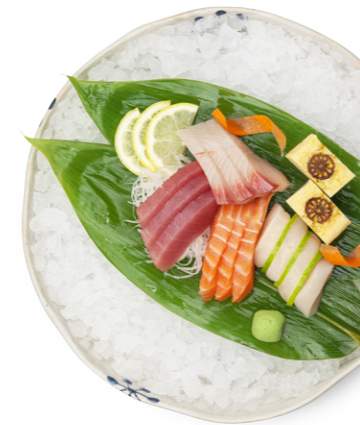
Sashimi deluxe GFO / 24.5 Assortment of salmon, tuna, kingfish, scallop and tamagoyaki sashimi