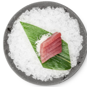
Tuna sashimi / GF / 12.5