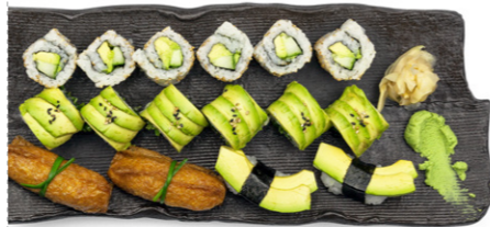
Vegan sushi set (16pcs.) VG / 17.5

Avocado, Inari nigiri, Avocado & Cucumber roll, Seaweed roll with avocado