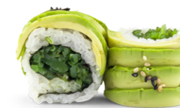
Seaweed roll with avocado (6pcs.) / VG / 9.5 Seaweed salad roll topped with avocado and sesame seeds