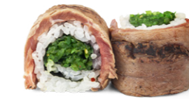
Aburi beef roll (6pcs.) / 14.5 Seaweed salad roll topped with seared beef, sesame seeds and aburi sauce