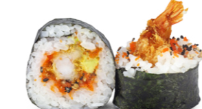
Tempura shrimp roll (5pcs.) 7.5

Salmon mixed with spicy sauce and cream cheese, fried in bread crumbs with miso aioli sauce on top