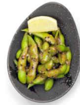
Spicy edamame beans VG / 5.5