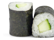
Cucumber roll (6pcs.) VG / GFO / 3.5