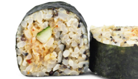
Tuna quinoa roll (5pcs.) / 9.5 Brown rice roll with quinoa, spicy tuna and cucumber