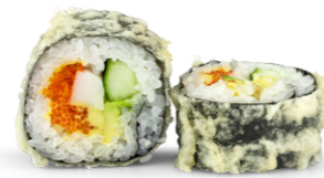
Tempura big roll (5pcs.) 8.5

Crabstick, avocado, cucumber and flying fish roe with miso aioli sauce roll fried in tempura batter with spicy sauce on top