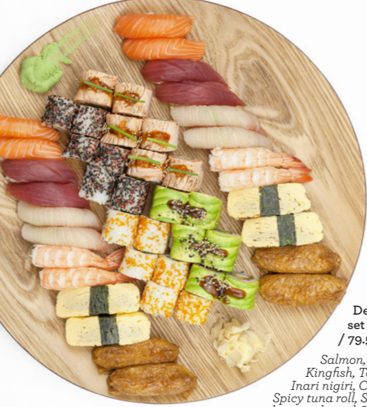
Deluxe sushi set (48 pcs.) / 79.5

6 Chargrilled skewers (Beef with parsley butter (2), Chicken breast with chilli and teriyaki sauces(2), Miso marinated salmon(2)) with seaweed salad, edamame beans, rice and miso soup