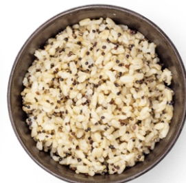
Brown rice with quinoa VG / 5