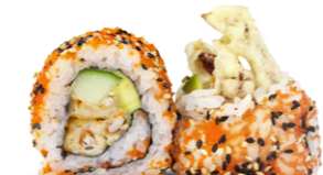
Soft shell crab roll (5pcs.) 8.5

Crabstick, avocado, cucumber and flying fish roe with miso aioli sauce roll fried in tempura batter with spicy sauce on top